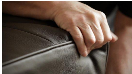
The cover is carefully fitted to the frames

Once sewn the covers are fitted onto the frames. As each piece is upholstered to the highest standards it's not uncommon for the covers to be taken off and further tailored to achieve the perfect fit. Decorative top stitching is applied (see our article on Detailing ) followed by the final upholstery process.