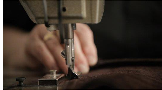
Upholstery material is cut then sewn

Once foamed, the furniture enters the upholstery shop. The upholstery material is selected and cut to templated patterns, before being sewn together.