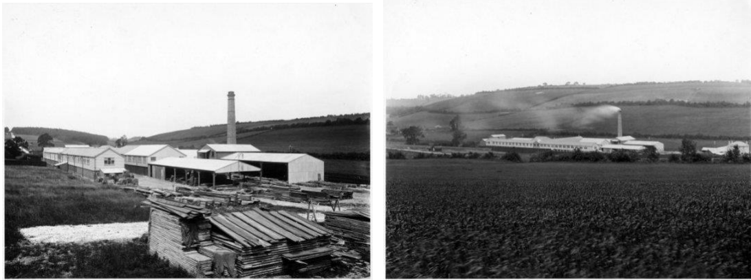
Old North Works as it was in the early 1900s

Nestled amongst the Chiltern Hills of Buckinghamshire, the Davison Highley workshops are where each piece of our furniture is designed, developed and manufactured to the highest levels of quality and longevity. Here's its story and the story of each piece of furniture we make.